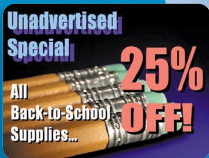
Retail Point of Sale